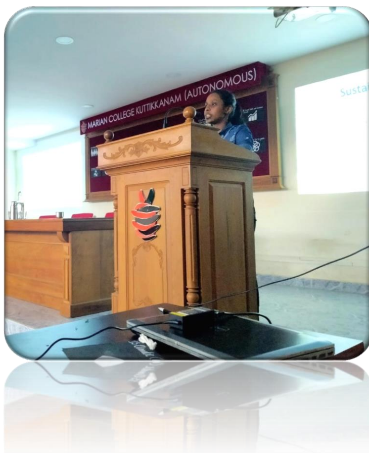
Paper Presentation by the Participants