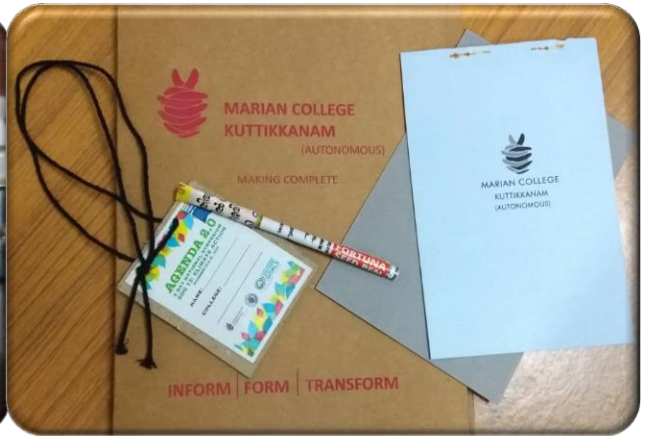
Figure 2: Cardboard Files, ID Cards and Paper Pens

The event was coordinated and conducted strictly following the green protocol. The following green initiatives were used: