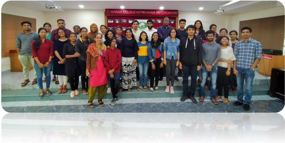
Closing ceremony of AGENDA 2.0