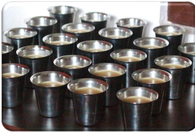
Figure 1: Use of steel glasses instead of paper cups